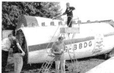
Volunteers cleaning the rear fuselage prior to assembly and the uncovering of the shiny, repainted Concorde.